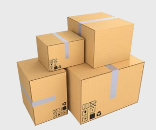
90% of packaging materials can be recycled immediately; paper materials contain 90% recycled materials