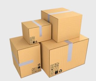
80% of packaging materials can be recycled immediately; paper materials contain at least 80% recycled materials