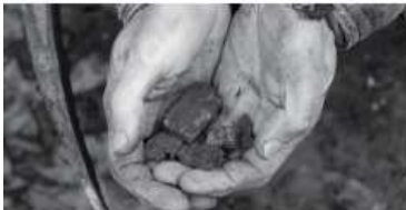
Raw materials are in line with humane mining and operations